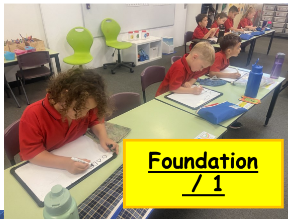
Foundation / 1

We have been settling into school practices and routines in the F/1 classroom. We use mini whiteboards everyday in English as part of our daily phonics program, and also regularly in Maths. Students have commenced learning about how we use these, practising the 3 important terms of 'Chin it' (show their work), 'Bin it' (clear their work) and 'Park it' (place their learning materials down). We are ready to start using our whiteboards for our learning this week and can't wait to show you our learning using these throughout the year.