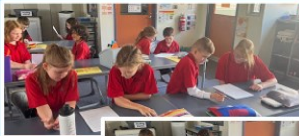
The 4/5 class working on their fluency.