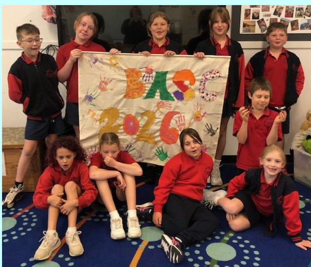
First week back we are working on our Hand Print banner.

Monday—Friday 7.00am—8.45am Monday—Friday 3.30pm—6.00pm